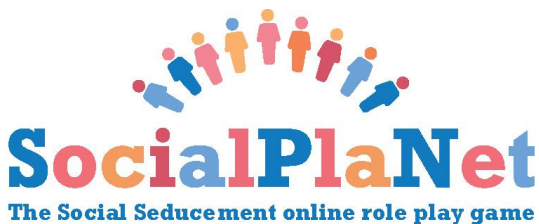
Figure 2: Logo of Social Planet

The following logo has been created for the game. The game has been named Social Planet and the logo has been so designed to be coherent with the project logo. A different logo has been created for the game in order to support the project's main outcome sustainability in the long term. It has been agreed that all official communication regarding the project activities will continue to make reference to the project official name and logo (figure 1).